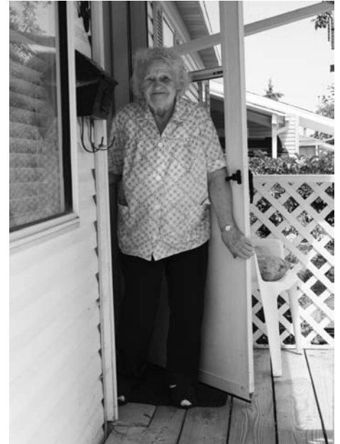
Napa's seniors are vulnerable to foreclosure scams and other frauds